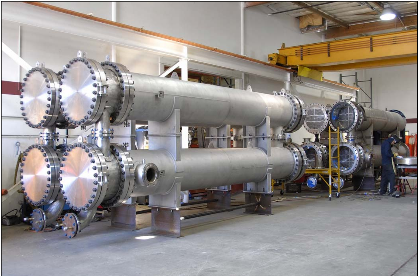
(4) TITANIUM HEAT EXCHANGERS PLUMBED IN SERIES FOR COOLING APPLICATION