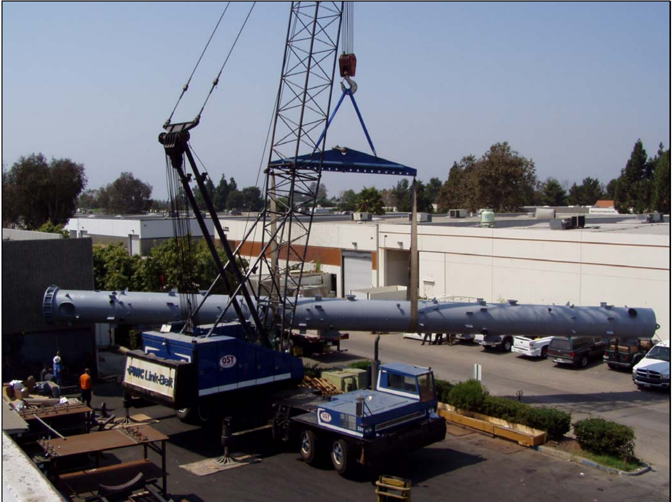
TANTALUM LINED CARBON STEEL COLUMN FABRICATED BY TITAN METAL FABRICATORS, INC.