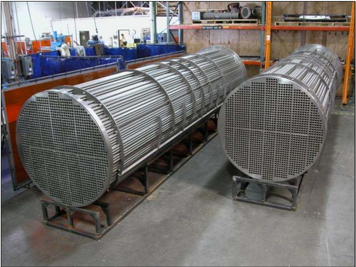
SOLID TITANIUM TUBE BUNDLES FABRICATED BY TITAN METAL FABRICATORS, INC.