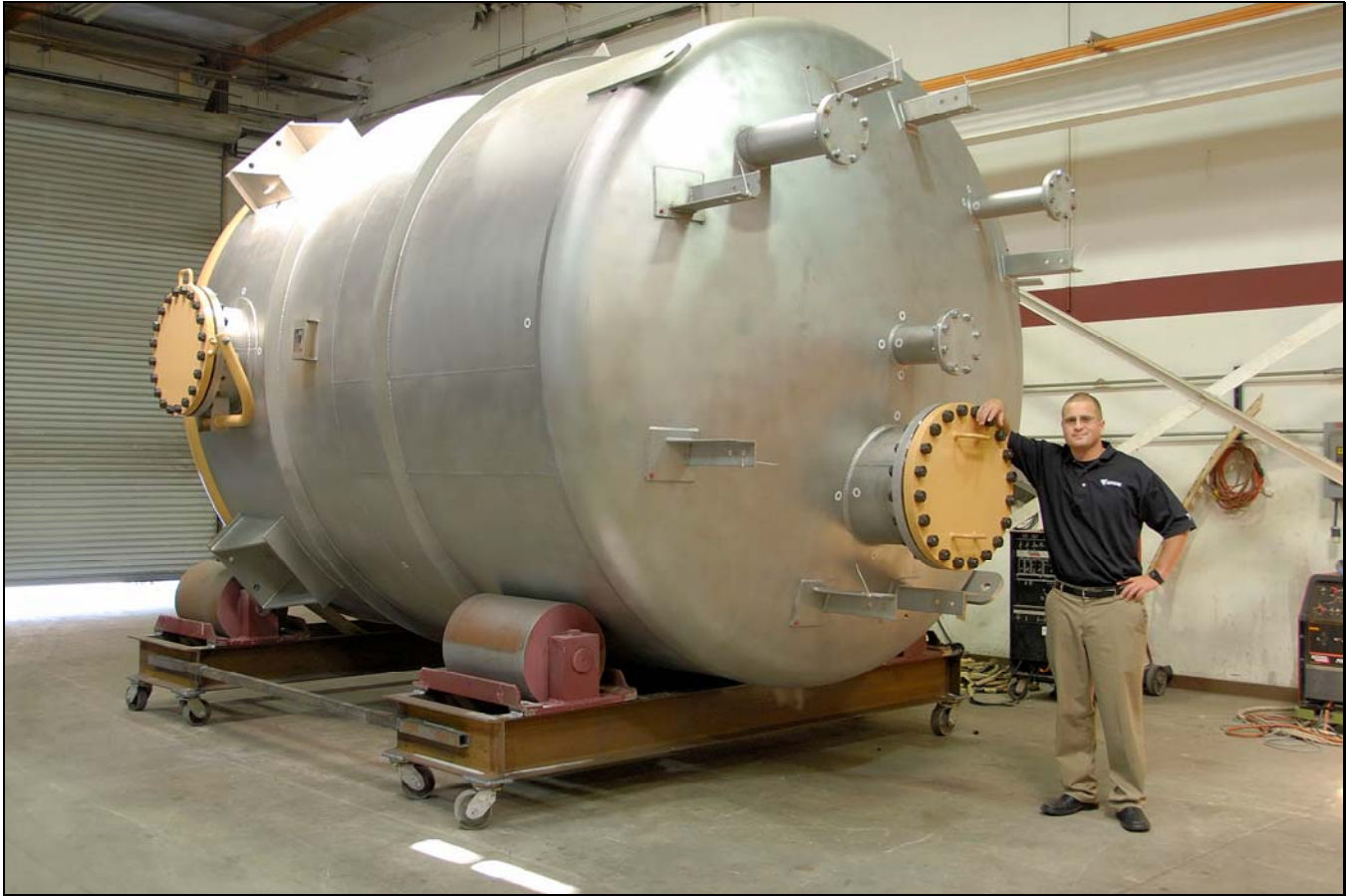
HASTELLOY C PRESSURE VESSEL