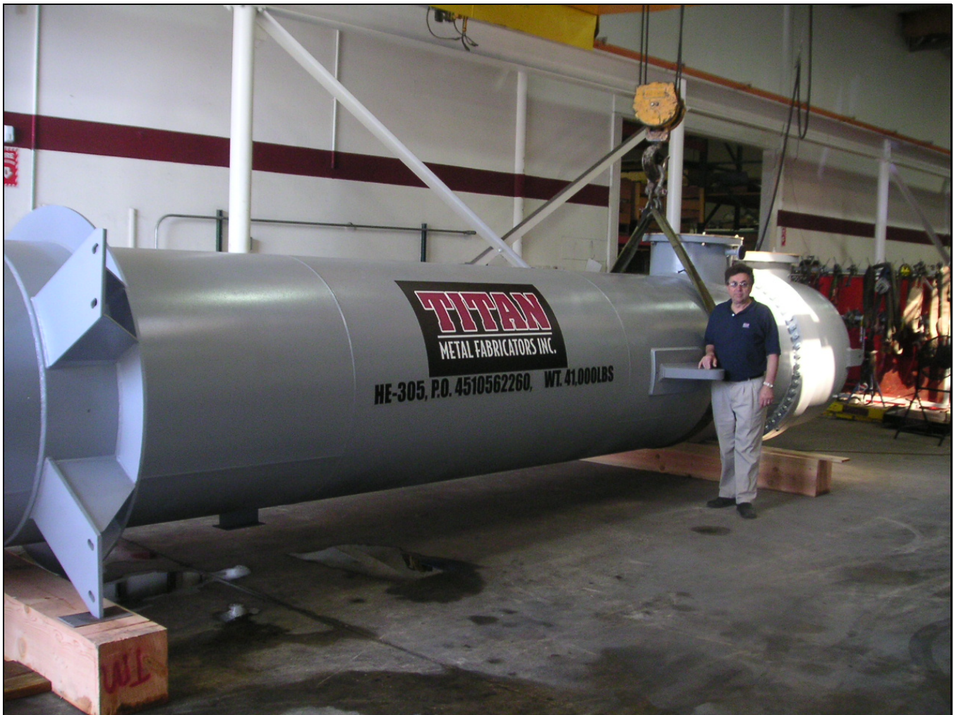
ONE OF THREE TITANIUM HEAT EXCHANGERS WITH EXPLOSION CLAD BONNETS FOR THE MANUFACTURE FOR PTA