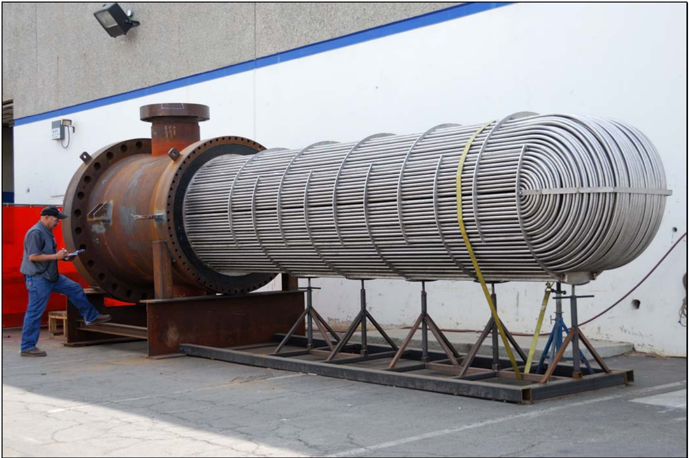
ALLOY 825 TUBE BUNDLE FOR REFINERY SERVICE