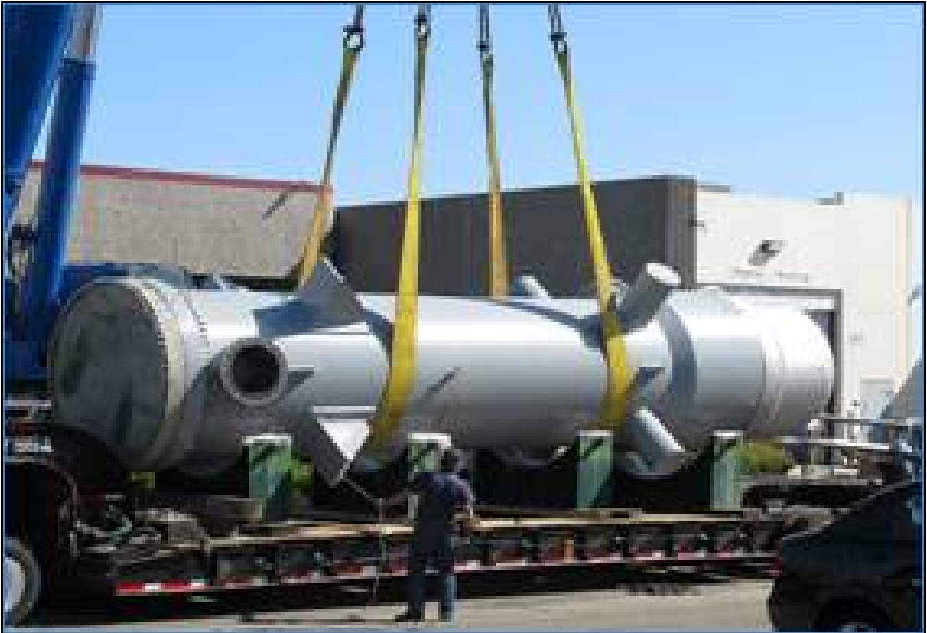
72" DIAMETER X 30 FT LONG TITANIUM GRADE 2 HEAT EXCHANGERS WITH EXPLOSION CLAD BONNET