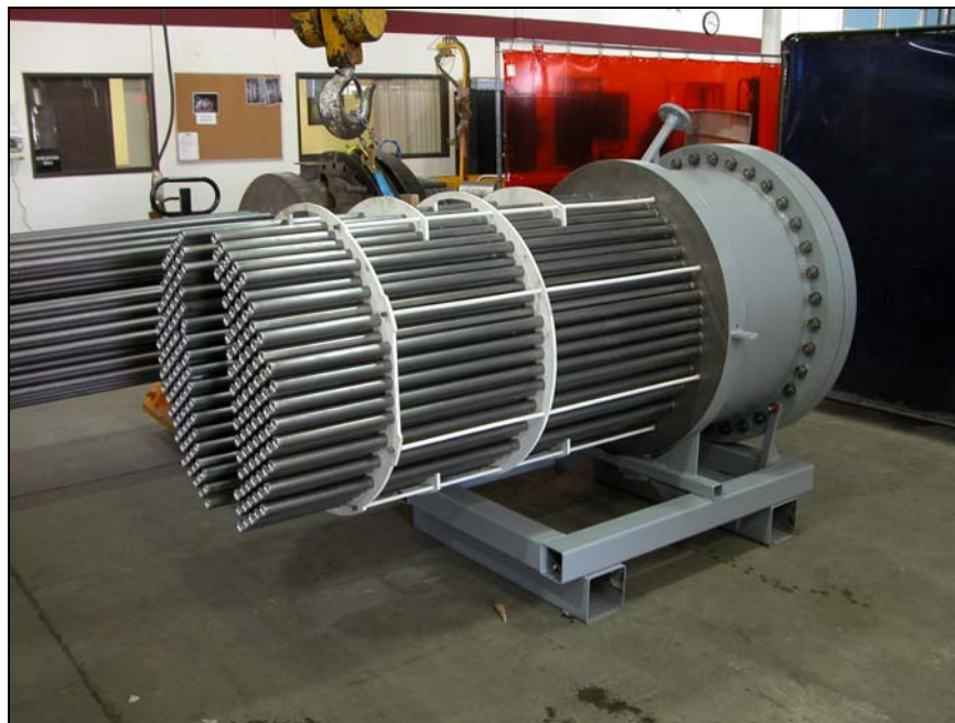
TANTALUM BAYONET HEAT EXCHANGERS FABRICATED BY TITAN METAL FABRICATORS, INC.