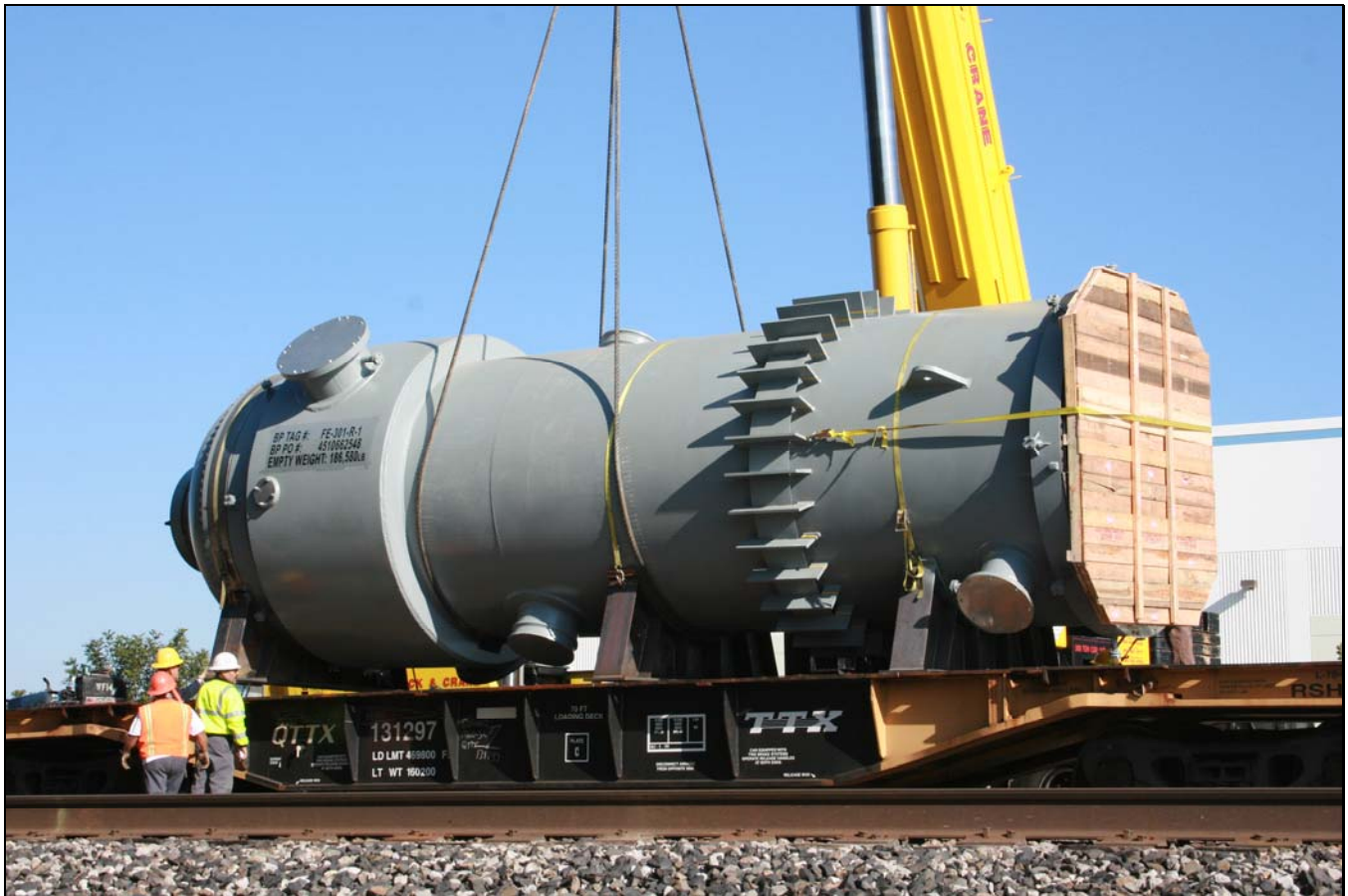
120" (3 Meter) Diameter x 30 Ft (9.1Meter) long Titanium Shell and Tube Heat Exchanger