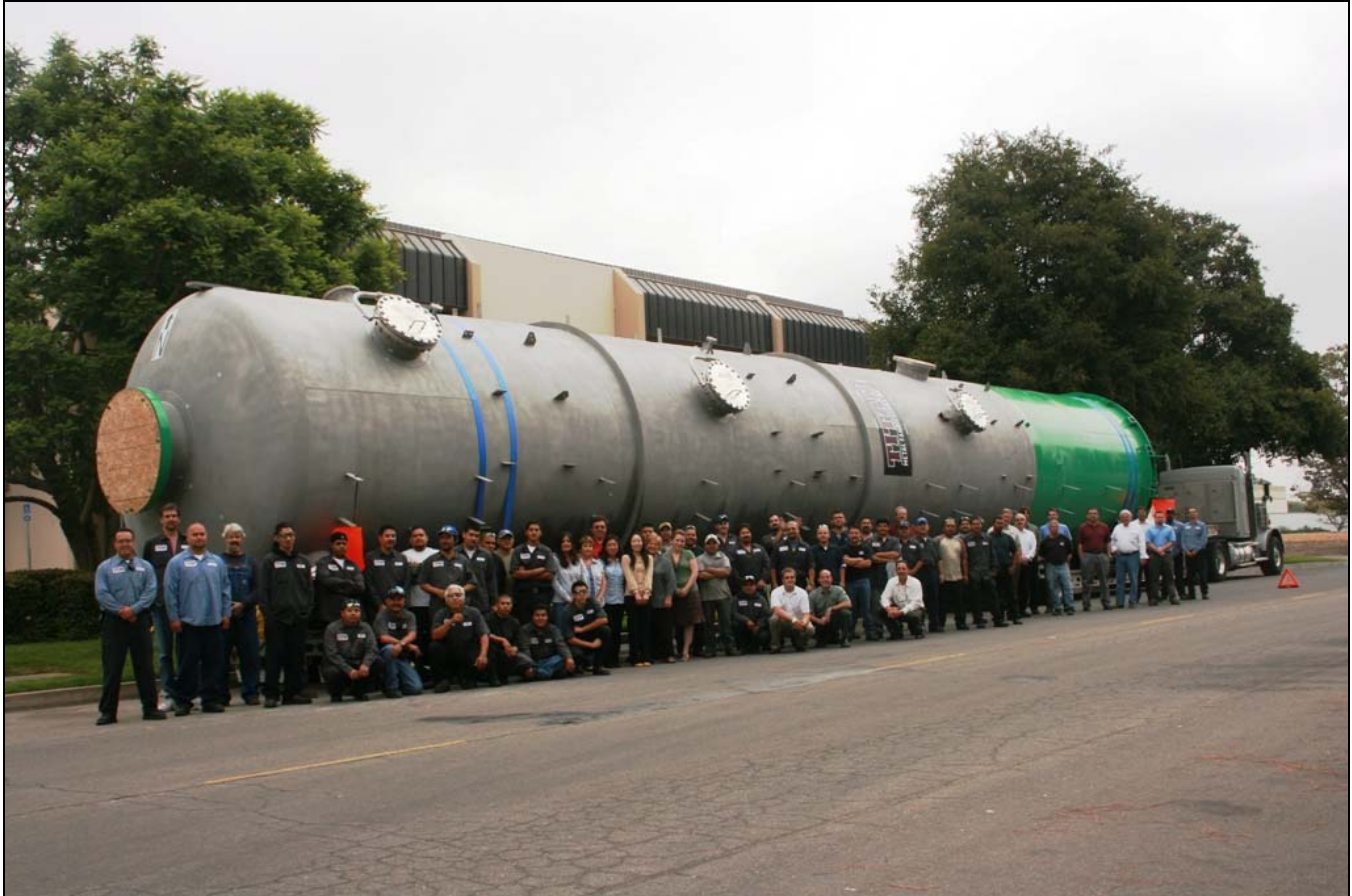
14 FT DIAMETER X 85 FT LONG ALLOY 20 COLUMN