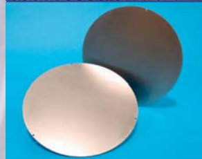
Custom Manufactured Parts