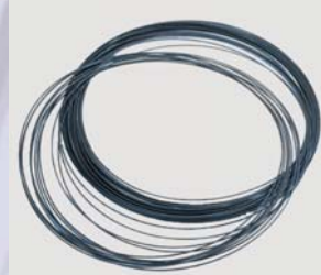
Ti-Clad Copper Wire